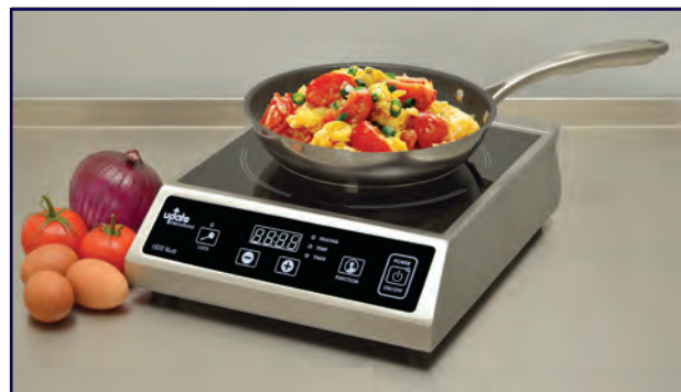
New 9" fry pan featured on Update Int'l Induction Cooktop [IC-1800WN].

* Non-stick Excalibur® coating is a registered trade name of Whitford Corporation.